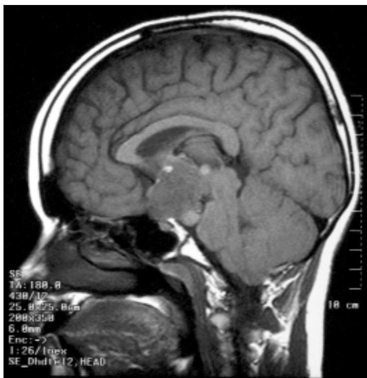
Figure 1. Magnetic resonance imaging of sella turcica showing a suprasellar expansive lesion in contact with the encephalic trunk, accomplishing the 3 rd ventricle.