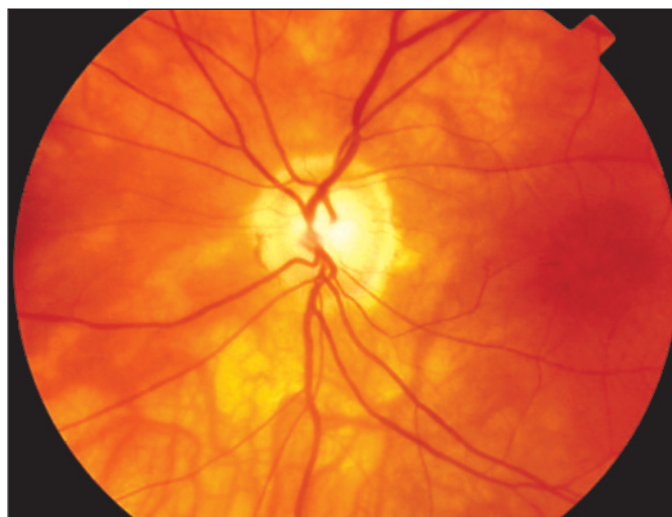
Figure 1 - Color photograph of the left fundus showing the cream-colored patch lesions located throughout the chorioretina and around the optic disc. There is cystoid macular edema and the visual acuity is 20/80. At this time, the patient was under AZA therapy

BC is a rare clinical entity characterized by scattered cream-colored or whitish depigmented areas in the fundus, cystoid macular edema, papillitis and chronic vitritis, but with minimal or no anterior segment involvement (1) . The most com-