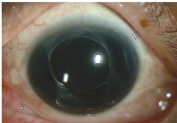
Figure 1. Anterior segment photo showing total aniridia with an intact ciliary body, intraocular lens, and capsular bag.