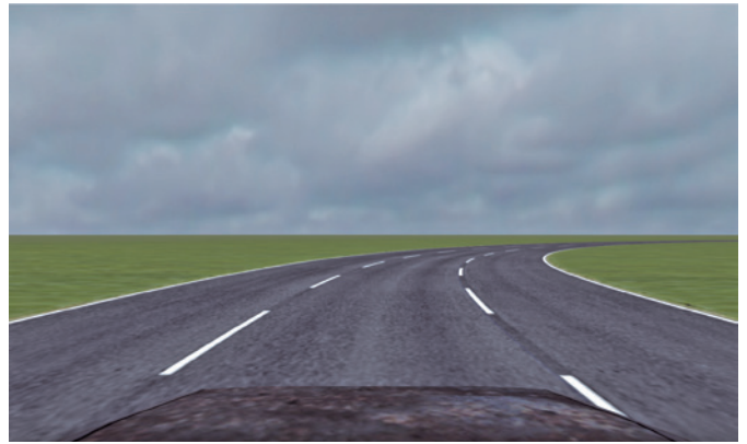
Figure 3. Curve negotiation test as presented in a driving simulator.

Another study compared the relationships between MVCs, SAP, UFOV and the driving simulator in asses-