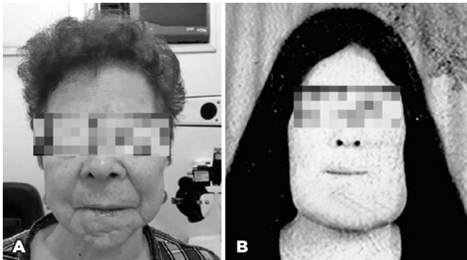
Figure 1. Photographs showing frontal view of the patient's face. A) At presentation to our service at 65-years-old; B) In early adulthood, prior to surgeries for repair of the jaw deformity.

On examination, her best-corrected visual acuity was 20/70 in the right eye (OD) and counting fingers at 30 cm in the left eye (OS). Fundoscopy revealed bilateral irregular gray lines radiating from the peripapillary area, yellowish pearl-like nodulations in both optic discs, and an elevated yellow subretinal macular lesion in OS (Figure 2 A-B). Fluorescein angiography demonstrated bilateral centrifugal hyperfluorescent radial peripapillary crack-lines, a finding indicative of AS, and choroidal neovascularization in the left macula (Figure 2 C-D). Optical coherence tomography showed optic disc and peripapillary hyporeflective ovoid images bordered by hyperreflective bands compatible with a diagnosis of ODD (Figure 2 E-F).