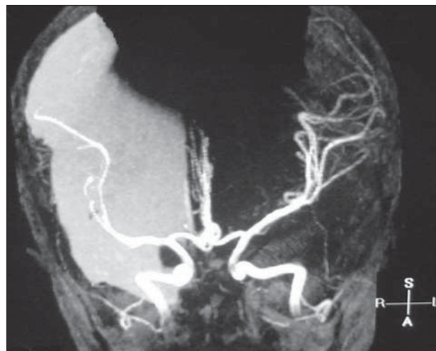
Fig 2. MRI angiography showing no vascular abnormality.

Most of AC are asymptomatic 7,8 . Seizures, signs of intracranial hypertension, focal neurological deficits, macrocrania, developmental delay and bulging of the skull at a site corresponding to the cyst are the main signs and symptoms of the lesion 8,9 . In the case reported here, the patient did not present any sign or symptom of an AC until the occurrence of the subdural hematoma. Rupture of the AC, and also its bleeding, are rare, usually associated with trauma in young adults 1,4,9 . The risk of bleeding of AC is 0.04%