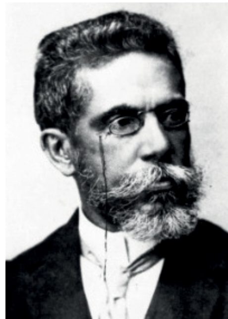
Figure 3. Machado de Assis (1839-1908): the most significant Brazilian writer