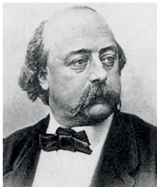
Figure 1. Gustave Flaubert (1821-1880), the author of Madame Bovary .

His friend Maxime du Camp reported many of Flaubert’s crises: “Very often, distraught and powerless to intervene, I would witness his seizures, which were indeed terrifying to