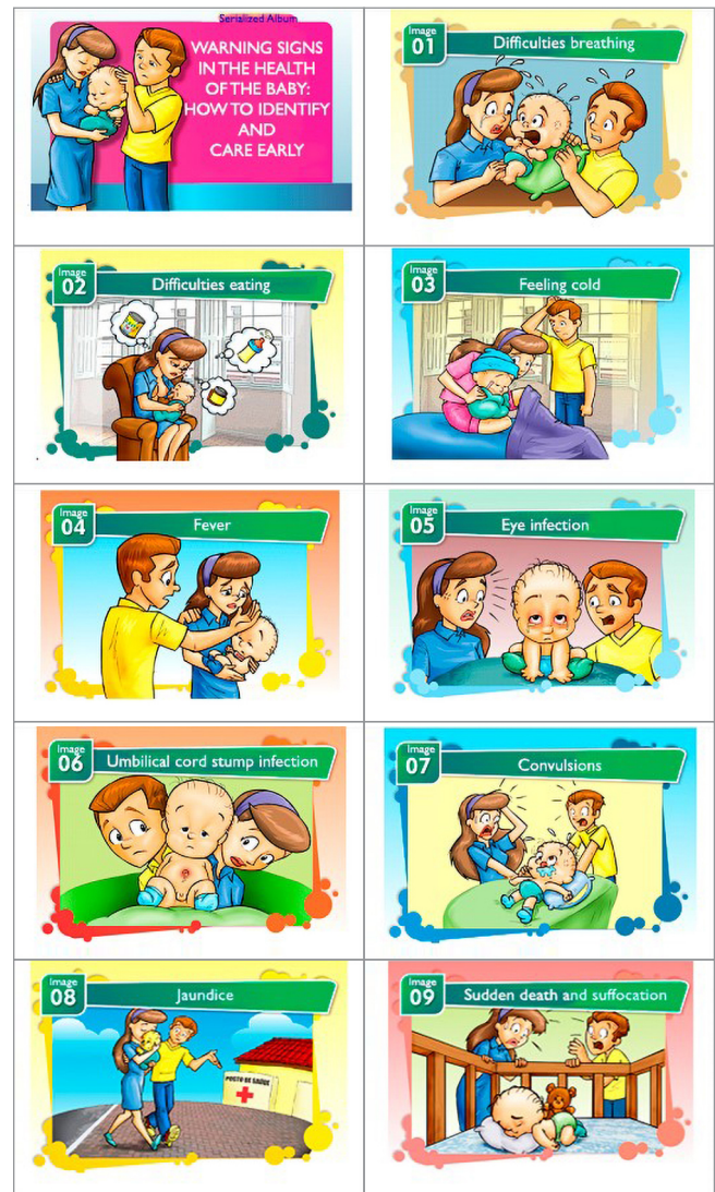
Figure 1 - Prototype of a version of the serialized album "Warning signs in the health of the baby: how to identify and provide care early", Fortaleza, Ceará, Brazil, 2020

After participants agreed and signed the Free and Informed Consent Form (FICF), the serialized album was presented to the mothers individually, through exposition and dialog. Then, the validation instrument was applied.