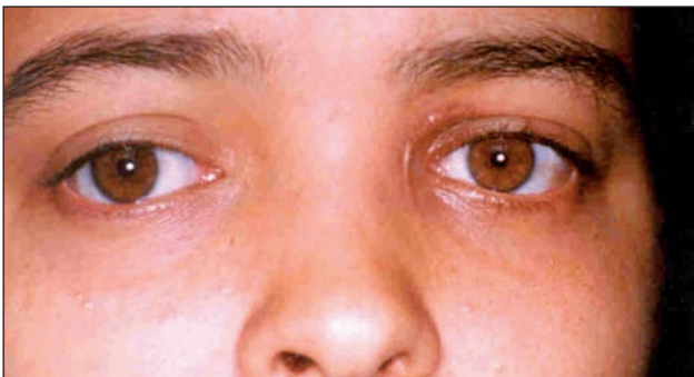
Figure 5: Final healing aspect

must emphasize that the abscess presence at CT by itself does not indicate surgery (1,2), since not always what is seen as na abscess in TC can be surgically confirmed (4).