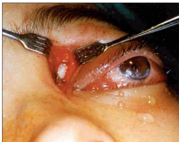
Figure 2: Pre-operative aspect showing intense proptosis of OE and incisional draining of purulence secretion