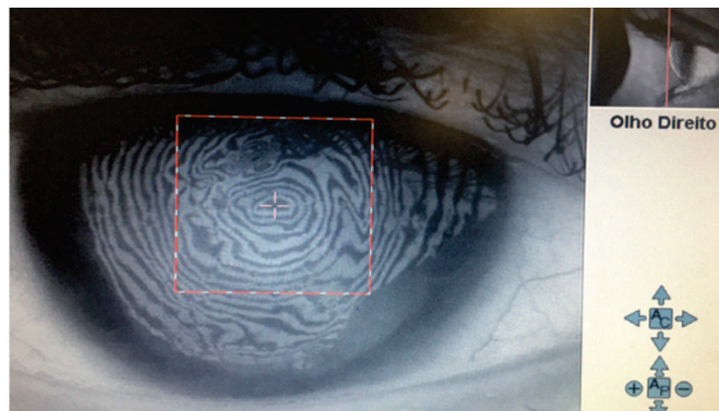
Figure 2. Corneal topography of the RE, diffusely changed by corneal edema, displayed by the irregularity of the Plácido rings.