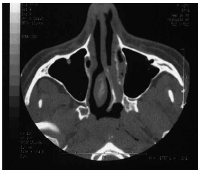
Figure 2. A case with CT scan characteristics similar to the one shown in Photo 1, left side choanal atresia, symmetrical maxillary sinuses and no sinus disease.