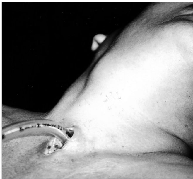
Figure 1. Laryngocele's external part. Notice the neck mass on the right. At this point the patient is already tracheostomized.

Our patient was a 45 year old female, housewife, seen in May of 2002, complaining of dysphonia for 40 days, associated with snoring. She did not smoke or had any pulmonary disorder, nor had she had prior laryngeal problems. During physical exam, she had a mass in her right cervical region (Figure 1) and during the laryngoscopic exam she had a bulging near the ventricular fold and the right aryepiglottic fold (Figure 2). We ordered a CT scan and an MRI (Figures 3 and 4) which revealed a large cystic lesion filled with air, thus confirming the diagnosis of laryngocele. In late June of 2002, while she underwent preoperative exams, she was having intense