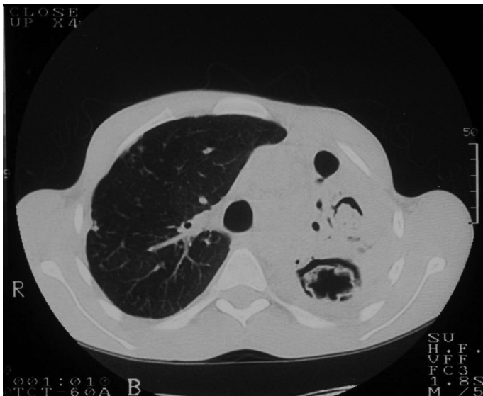
Fig. 2 - Left pulmonary parenchyma destruction with two cavities in the superior third. Upper cavity (3 cm diameter) within spherical mass, and cavity below (4 cm) within laminar pathological material.

Illustrative Case (Case 1): A 28-year-old male, presenting fever, dyspnea, chest pain, cough and hemoptysis for two months was admitted to the hospital. The patient had a chronic hepatopathy due to B and C hepatitis virus and had received an incomplete treatment for tuberculosis two years before when he had positive sputum smear for acid-fast bacilli and HIV test (enzyme-linked immunosorbent assay confirmed by Western blot). At the time of presentation his sputum was negative for staining of acid-fast bacilli but he was started on tuberculosis therapy because of previous incomplete treatment with zidovudina (AZT), didanosina (DDI) and sulfamethoxazol-trimetoprim (SMT-TMP).