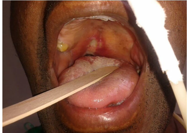
Figure 1 - Clinical image of a 51-year-old HIV-infected male patient who presented with a several week history of dysphagia and odynophagia. A painful bluish-purple papular lesion with an erosive center on the right palatoglossal arch is seen. The lesion was very painful

Histopathological studies showed lobular vascular proliferation with epithelioid endothelial cells and an intervening edematous stroma with an inflammatory infiltrate containing multiple neutrophils (Figures 2A and 2B). When