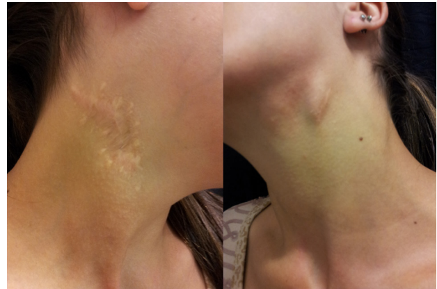
Figure 1 - Right and left cervical regions of the neck, respectively, showing site scarring from suppuration and lymphadenopathy

followed by DNA sequencing for bacterial identification, as previously described 10 . The ITS and Pap31 DNA sequences amplified from the patient were 100% identical to four and six DNA sequences of the B. henselae strain Brazil-1 previously described in dogs, cats and a human from Brazil, respectively (Figure 2). A definitive diagnosis of chronic lymphadenopathy due to bartonellosis was undertaken. The patient was treated with intravenous gentamicin (160 mg/day) for two weeks and oral erythromycin (2 g/day) for six weeks. After having been discharged, she continued on azithromycin (500 mg/day) treatment for one year.