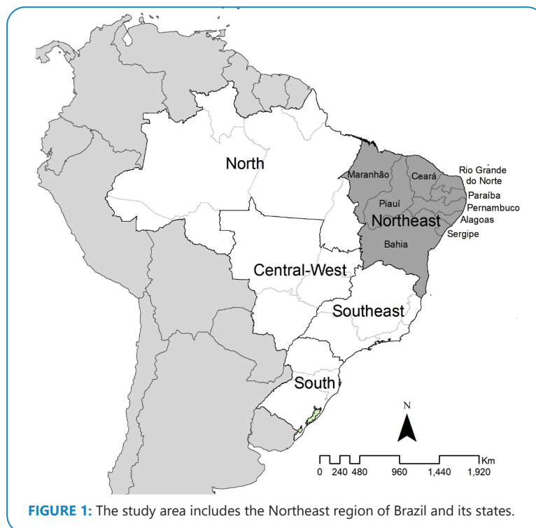
FIGURE 1: The study area includes the Northeast region of Brazil and its states.

Northeast Brazil is composed of 9 of the 27 states ( Figure 1 ). In the country, this region has the largest number of municipalities (n=1,794/5,570; 32.2%), where approximately 28% of the Brazilian population resides. Approximately 53 million inhabitants are distributed over 1.5 million km 2 , with 48% living in rural areas 16 . It