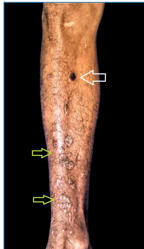
FIGURE 1: Melanocytic lesions, melanoacanthoma (white arrow), and verrucous lesions (green arrows).

We highlight the rarity of this case and the need to rule out other possibilities in the differential diagnosis, mainly in patients living with HIV infection.