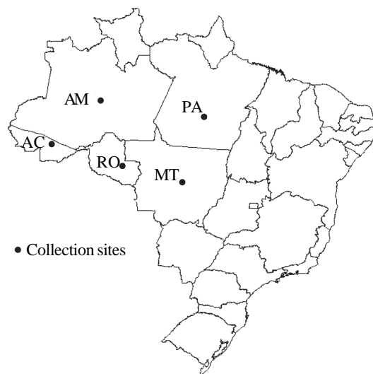
Fig. 1: location of the collection sites. AC, Acre; AM, Amazonas; MT, Mato Grosso; PA, Pará; RO, Rondônia.

Study area - Seven randomized surveys were conducted from 1993 to 2003 in five states of the Amazon region of Brazil (Fig. 1). A total of 1206 serum samples and blood films were collected from different populations in the states of Pará, Rondônia, Mato Grosso, Acre, and Amazonas. All participants were interviewed directly or through a respondent inhabitant and allocated a unique identification number. Informed consent was obtained from all individuals before admission into the study. The information collected included name, sex, age, and time remained in the area.