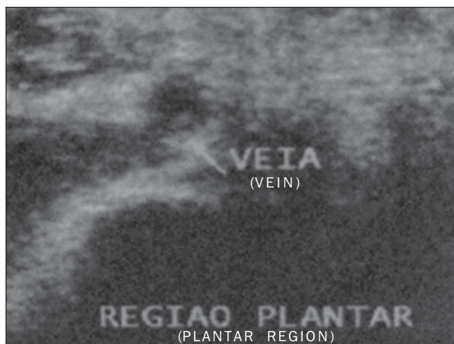
Figure 2. Ultrasonography of plantar region showing hypoechoic material within the lateral plantar vein in association with ectasia and non-compressibility of the vessel, as well as absence of flow at Doppler study.

Cardinal signs and symptoms of PVT include recent onset (7,8) of plantar pain (1-3) and local edema with a typically unilateral presentation (1) in association with limited ambulation (2) .