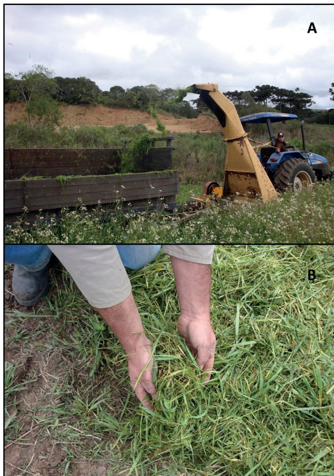
Figure 1. Harvesting fresh plant material in early spring (A), and mulch layer sampling (B) for hand spreading on potato plots at Lapa Experimental Station, Paraná State, southern Brazil.

PLB development, since air temperature decreases and relative humidity increases during the growing period. This explains why PLB started nearly 20 days earlier in fall 2015, compared to the two studied spring seasons. In addition, 100% severity values for both cultivars were reached at the same time in fall 2015, in contrast to spring 2014 and 2015, when the death of the resistant cultivar ‘BRS Ana’ due to PLB was approximately 14 and 9 days later, respectively, than that of ‘Agata’ (Figure 3). Differences in the epidemics were smaller in spring 2015 due to excessive rain. The AUDPC for the spring seasons was higher than that for the fall season because the overall epidemics lasted longer in spring (Figure 2B; Table 1).