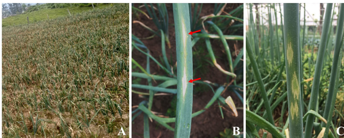
Figure 1. Symptoms of Iris yellow spot orthospovirus in onion ( Allium cepa L.) observed in Santa Catarina State, Brazil. Sudden leaf blight in a bulb onion crop (A); arrows indicate whitish diamond-shaped spots on onion leaves (B); scape showing diagnostic diamond-shaped spots in a seed onion field (C).

Out of 105 field samples analyzed, 33 (31.4%) had a positive signal to IYSV antibodies, compared to the negative and IYSV-positive controls. It is worth pointing out that all IYSV-positive samples were collected from symptomatic onion plants. Besides, no leaf samples obtained from symptomless onion plants or weed species tested positive. IYSV has been detected in six counties in Santa Catarina State (Figure 2). Interestingly, samples collected in all three crop seasons led to similar infection rates. Among IYSV-positive samples, 20 were collected in the 2017/18 crop season (11 from Ituporanga, five from