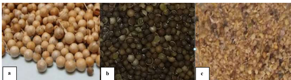
FIGURE 2. Unpeeled (a) and peeled crambe fruits (b) and peels (c) obtained during processing.

The second sieve (b), with a 1.5 mm mesh, received all the crambe parts and the whole crambe were separated from peels by a shaking process. The third sieve (c), with a 1 mm mesh, received the peels along with crambe pieces, and the broken grains were separated from peels. Figure 2 shows the unpeeled and peeled crambe and peels.