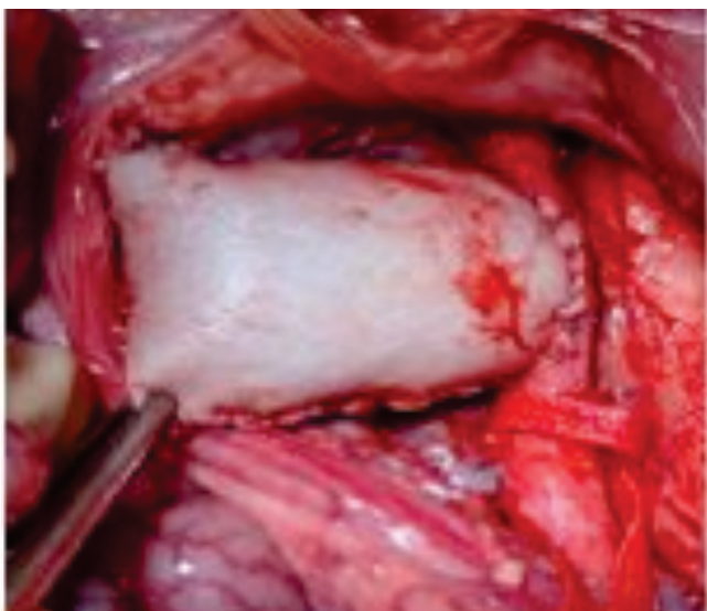
Figure 1. Saccular aneurysm after blood flow release.

Vascular access to aortography was obtained by surgical dissection of the right femoral artery, and the arterial puncture performed under direct vision with a 16 Jelco catheter. After the advance of a 0.035x260 cm angled tip hydrophilic guidewire, we introduced a 11 cm 5F