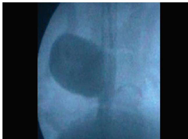
Figure 2. Aortography post-stent implantation.

We recorded the images through the Duplex