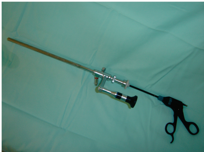
Figura 1. Óptica laparoscópica com canal operatório.

-type 5mm operative channel (Ref: S26034AA, Richard Wolf GmbH, Knitt Knittlingen, Germany) (Figure 1); 2) a 12mm reusable trocar; 3) a 5mm diameter and 43cm in length, curved, rotational, isolated, unipolar Maryland forceps for dissection and grasping; 4) a 5mm in diameter and 43cm in length, curved, rotational, isolated; 5) a 5mm in diameter and 43cm in length, reusable, rotational Hem-o-lok applicator; 6) a 5mm in diameter and 43cm in length, isolated, unipolar Hook clamp; 7) a 5mm in diameter and 43cm in length endoscopic cannula to suction and irrigation; 8) a 3mm in diameter and 36cm long, rotational, isolated grasping forceps (minilaparoscopy).