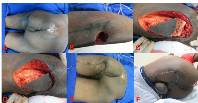
Figure 2. Ischiatic pressure lesion. (Patient 9)- Ischiatic pressure lesion. A) marking of posterior fasciocutaneous thigh flap; B) defect after bursa resection; C) the flap was dissected and partially de-epidermised; D) inserted flap fixed at ischium periosteum for filling and protection; E) immediate post-operative; F) one month of post-operative with stable covering.

Medium time of hospitalization was 3.6 days (2-6 days), medium follow-up was 9.1 months (2-18 months). All patients maintained their wound closed and none of them showed recurrence during the follow-up period. Outcome data are described at table 3.