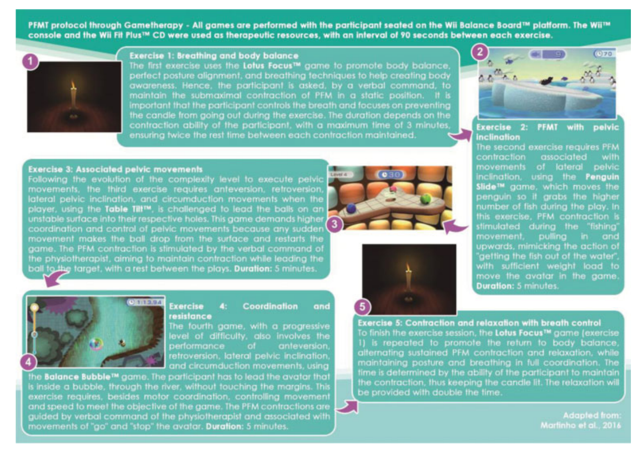
Fig. 1 Supervised PFMT protocol through Gametherapy.

Another secondary result considered in the present study was feasibility, defined as the rate of adherence and completion of the protocol of the participant of both groups. To calculate adherence to the protocol, the participants had to perform the 10 PFMT sessions. Adherence to PFMT at home was calculated considering the frequency of exercises performed at home for 5 consecutive weeks, monitored through