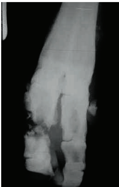
Fig.1. Dorso-plantar radiography evidenced septic arthritis in the proximal interphalangeal joint in the medial foot of right forelimb.

When the variables of age and type of lesion were compared, a correlation was observed. Experienced animals were most affected by injuries, and the most common were, septic arthritis (Fig.1), osteoperiostitis (Fig.2), enthesopathy (Fig.3), degenerative joint disease and fracture. The beginner bulls were less affected by lesions, with the most common being enthesopathy, septic arthritis, fractures and osteoperiostitis (Table 1).