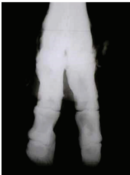
Fig.2. Plantar-dorsal radiography evidenced osteoperiostitis in the 3rd and 4th metatarsi of the left forelimb.

In the analysis of data on the relationship between the affected limb and weight, where we evaluated the categories of age and affected limb, there was a great disparity among the beginner animals in the percentage of animals injured in the forelimb (13.3%) and in the hindlimb (25.8%). In experienced and heavier bulls, the percentage of injuries corresponded to 27.7% in the forelimbs and 32.5% in the hindlimbs.