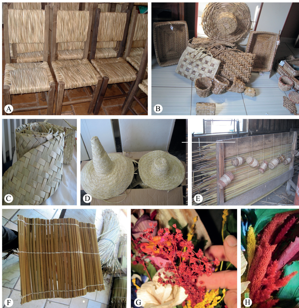
Figure 2. Forms of use of different species of aquatic vascular plants: “taboa”: A - Chair “empalhamento”, B - Different handicrafts. “tiriricas”, C - braids, D - hats. “junco”, E - mat on the “cavalete”, F - decorative table setting. “capins”, G and H - arrangements of inflorescences.

raw materials (8 %). There was no record of cultivation of any of the used species. Residents of Osório, who worked mainly with Schoenoplectus californicus , performed collection in lagoons. In the municipalities of Imbé and Maquiné, collections were performed in wetlands.