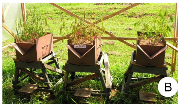
Figure 1. Containers just after planting 15 seedlings each (A), and 24 days after treatments application and water suppression (B). On the left, density 2D (container with 10 seedlings), center 3D (15 seedlings), and right 1D (five seedlings).