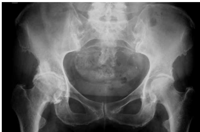
Figure 1A – AP radiograph showing arthrosis in the right femoral coxa.