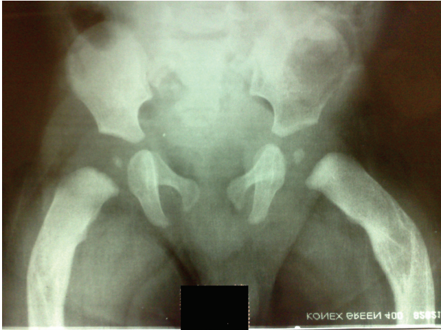
Fig. 7 - Radiograph of the proximal femur at the age of six months.