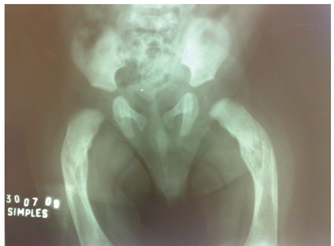
Fig. 6 - Radiograph at the age of four months.