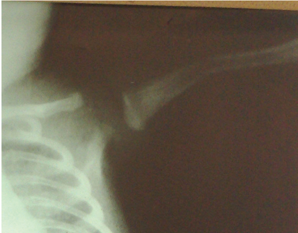
Fig. 2 - Humeral fracture at the time of admission.