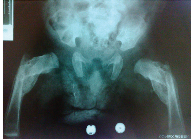
Fig. 4 - Radiograph of the femurs at the age of three weeks.

to be postponed until the child's infectious and respiratory conditions had stabilized.