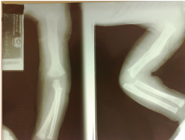
Fig. 8 - Radiograph of the humerus at the age of six months.