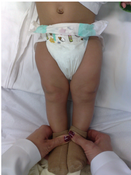
Fig. 9 - Photograph at the age of six months, showing absence of anisomelia or significant deformities.

consultations, through which it could be seen that the child was completely healthy, without anisomelia and/or associated deformities (Fig. 9). From control radiographs, satisfactory evolution of both the femoral and humeral bone consolidation was observed.