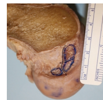
Fig. 2 - Macroscopic view of the lateral face of the medial femoral condyle of a right knee, with the linear representation of the medial intercondyle ridge (a-b) and the medial bifurcated ridge (c-d), with reference marker.

In 23 of the 24 knees dissected (95.8%), we noted that a medial intercondylar ridge was present: this is a bone crest proximal to the femoral insertion of the PCL. In 20 knees (83.3%), we noted that a medial bifurcated ridge (a more tenuous bone prominence) was present, separating the AL and PM bundles (Fig. 2).