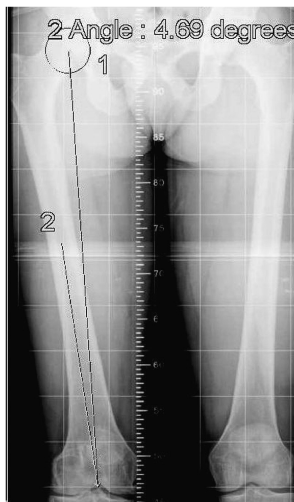
Fig. 1 – Magnification of the femur on a panoramic radiograph on the lower limbs showing the angle of the distal femoral resection determined by the intersection of the femoral mechanical axis (FMA) and the femoral anatomical axis (FAA).

The axes were traced out using a ruler and the angles were measured using a protractor (Desetec® for both instruments), graduated in 0.1 mm and 0.5° divisions. All the measurements