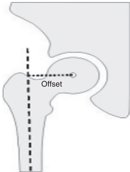
Fig. 1 – Measurement of the offset.

software used in this statistical analysis comprised SPSS V17, Minitab 16 and Excel Office® 2010. The significance level was set at 0.05 (5%) and all the confidence intervals constructed over the course of the study were 95%.