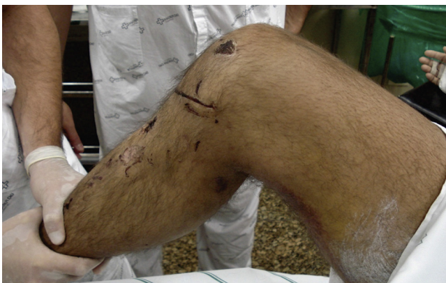
Fig. 1 – Appearance of the limb with posterior fall of the tibia.

The vascular surgeon was called in, on an emergency basis. He got the call promptly and arrived in the operating theater after around 50 min. No additional diagnostic tests were requested, given the high degree of suspicion of vascular injury and the need for emergency intervention.