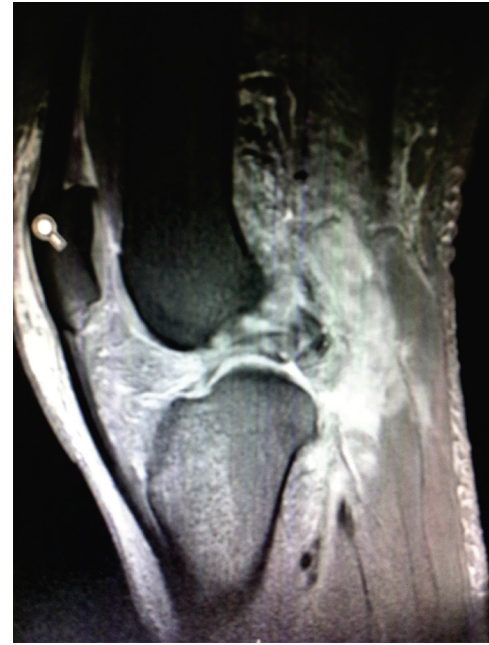
Fig. 2 – Magnetic resonance imaging of the initial lesion, showing the severe ligament injury.

The patient was positioned in ventral decubitus and underwent revascularization surgery with interposition of a graft from the great saphenous vein, by means of Trickey's posterior access. The revascularization was terminated five hours and 45 min after inflation of the tourniquet for the ligament reconstruction surgery (i.e. this was the total duration of ischemia in the limb) and the patient was sent to the intensive care center for postoperative recovery. After a few hours, the patient was returned to the surgical center due to poor perfusion of the right leg. A Foghart catheter was introduced and the patient underwent decompressive fasciotomy of the four compartments of the same leg. The patient was kept in the intensive care center for another three days and was released from hospital in a good condition after 24 days.