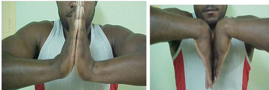
Fig. 3 – Images eight months postoperatively showing restored range of motion and strength, but with a decrease in the last 10° in extension and flexion of the right wrist.

This pattern of carpal injury was studied by Garci-Elias et al., 9 who identified longitudinal and axial carpal instabilities, subdivided into three groups: axial-ulnar, axial-radial, and axial-radial-ulnar. Thus, the reported case would be classified as a longitudinal carpal instability, axial-ulnar subtype, specifically transtriquetral perihamate. It is important to note that the cleavage line in the diastasis between the capitate and the hamate may be subtle and the diagnosis may be overlooked.