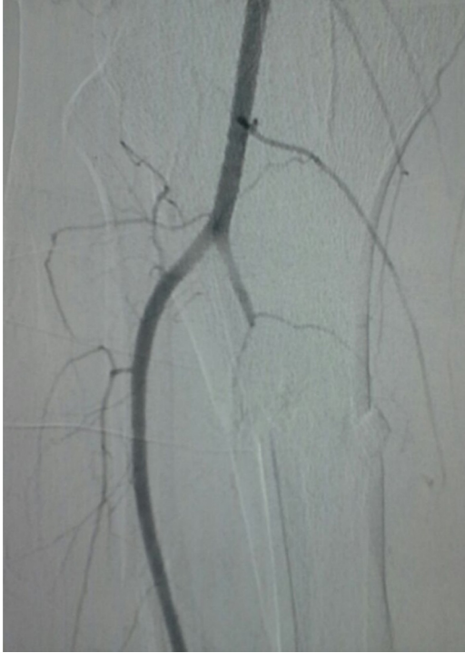
Fig. 3 – Arteriography disclosing vascular injury.

treatment. These measures are accompanied by pain, increased incidence of infections, scar retraction, rejection, and failure. 4 Proximal fractures of the tibia present increased risk for compartment syndrome. 5 This condition is more frequent in cases with vascular injury and is characterized by increased blood pressure in regions surrounded by inelastic muscle fascia, altering the local microcirculation and undermining tissue viability. Compartment syndrome is an