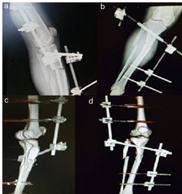
Fig. 1 – (a) Plain lateral view radiograph; (b) plain anteroposterior radiography; (c) lateral view 3D reconstruction CT scan; (d) anteroposterior 3D reconstruction CT scan.

Seven days after fasciotomy, the patient presented a clean wound, without signs of infection. At that moment, the elastic suture system was positioned. An elastic band for vascular surgery was attached to the skin with metal clips, which were applied with surgical stapler 0.5 cm from the incision edges, starting at the proximal apex and continuing toward the distal vertex. The wire was attached to one side and passed through the incision to be attached on the opposite side, in a sequence that resembles a zigzag from the proximal to the distal regions – the shoelace technique. After 7 days, an overall approximation of the wound edges was observed; when the elastic