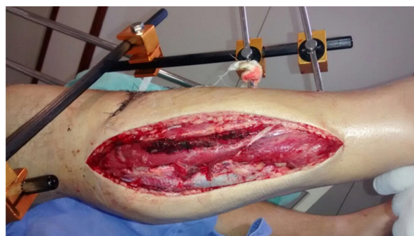
Fig. 2 – Decompressive fasciotomy.

The identification of compartment syndrome is not always easy, as peripheral perfusion and arterial pulses are usually observed, not representing good parameters for clinical suspicion. In laboratory tests, an increase in creatine kinase (CK) is observed, which indicates myoglobinuria and suggests the diagnosis. 2 Fracture of the tibial shaft is one of the most frequent causes of compartment syndrome. 3 The repair of its surgical wounds is performed with grafts or large skin flaps; this leads to new wounds, which also demand