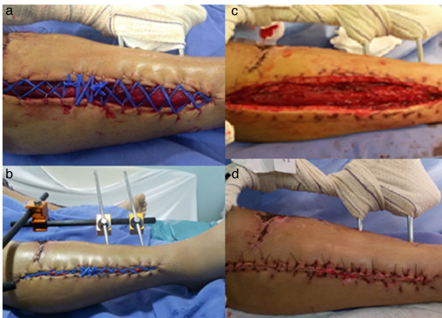
Fig. 4 – (a) Zero-hour elastic suture; (b) 48 h of elastic suture; (c) skin aspect after removal of the elastic suture kept for 7 days; (d) 0-h secondary suture after removal of elastic suture.

The fasciotomy incision represents itself an injury to the patient; furthermore, it increases the risk of infections and the length of hospital stay. Several procedures have been described for closing this type of incision, using various types of materials; there are even reports on the use of properly sterilized common elastic string fixated to the skin adjacent to the incision with surgical suture, providing good approximation of the wound edges in just 5 days after the procedure, with full