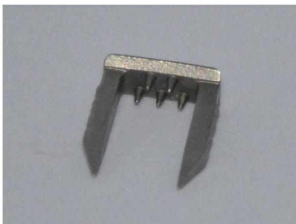
Fig. 2 – Thorny staple.

In 17 specimens, the graft was secured only with a 9-mm diameter titanium interference screw (Group 1). In Group 2, a thorny staple was used (Fig. 2) in association to the interference screw to secure the graft (Fig. 3).