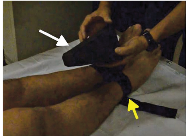
Fig. 2 Following the application of the Velcro strip (yellow arrows) around both ankles at the supramalleolar level, attention is turned to the application of varus stress on the knee. A soft wedge (white arrows), made of Ethylene vinyl acetate, is placed between the knees. It is important to ensure that the base of the wedge is positioned at the tibial tuberosity level and the tip of the wedge is at the distal femur level.