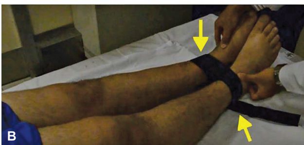
Fig. 1 The patient is placed supine on the radiographic table and asked to extend the knees. The ankles and thighs of both limbs are placed in contact. Following this, a Velcro belt (yellow arrow) is used at the supramalleolar level to keep the medial malleoli in contact.