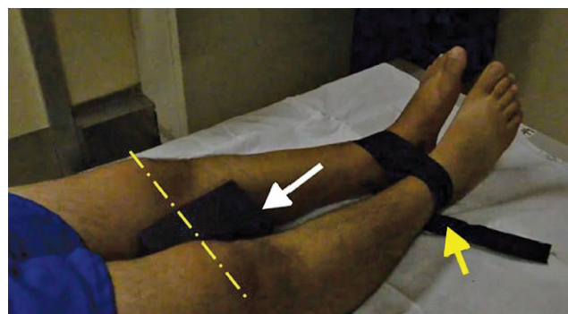
Fig. 3 Once the Velcro belt (yellow arrow) and the soft wedge (white arrow) are correct placed, the force vector applied on the knee simulates the varus manual stress radiographs. Of note, it is essential to ensure that both patellas are perpendicular to the radiographic table and that the patellar level is the even (yellow line).

abduct; however, the Velcro belt placed around the ankles avoid the limb displacement. The result vector is a varus stress performed simultaneously in both knees (► Fig. 3). This test is able to detect lateral laxity simultaneously and bilateral, taking only one radiographic (► Fig. 4). This technique can be performed with the knee in flexion or extension, removing the soft pad on the popliteal fossa to perform in extension. Once all