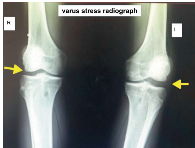
Fig. 4 The final bilateral simultaneous varus stress radiograph is showed in this picture. The soft wedge placed between the knees and the Velcro belt at the supramalleolar level produce a varus stress in both knees at the same time, requiring just one radiograph to evaluate side to side difference in the lateral compartment. The yellow arrows show the lateral gapping. R, right; L, left.

the previous steps are performed, the physician must ensure that both patellas are at the same level. Following this, the radiographic tube is placed 1 m from the radiographic cassette and centered on both patellas and the image is acquired. Advantages and disadvantages of our technique is presented in ►Table 1, while ►Table 2 shows the pearls and pitfalls of this technique.