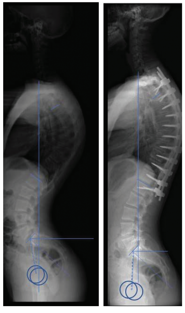
Fig. 2 Clinical case - male, 17 years old. He maintained the neutral sagittal alignment. Improvement in postoperative kyphosis and lumbar lordosis from 80° to 56° and 84° to 55° respectively.

We report that the mean preoperative values of PI, PT and SS were of 48°, 10° and 39° respectively. These are consistent