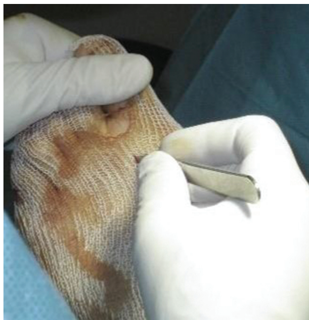
Fig. 1 Percutaneous release of the adductor hallucis tendon.