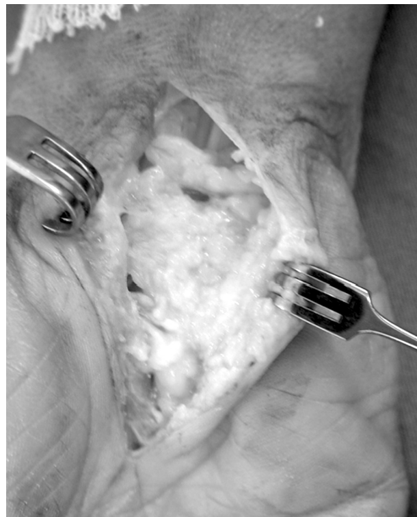
Fig. 3 An hypothenar fat pad flap was performed to interpose adipose tissue from the hypothenar eminence between the median nerve and overlying transverse carpal ligament and surgical scar.

The concept of vein interposition, placing the vein around the median nerve as a barrier to prevent scarring, was originally described in rats but it has been used clinically. 48,50 The surgical technique consists of releasing the median nerve from cicatricial adhesions and identifying the region to be covered by a vein. After harvesting 25 to 30 cm, the saphenous vein is opened longitudinally. With the