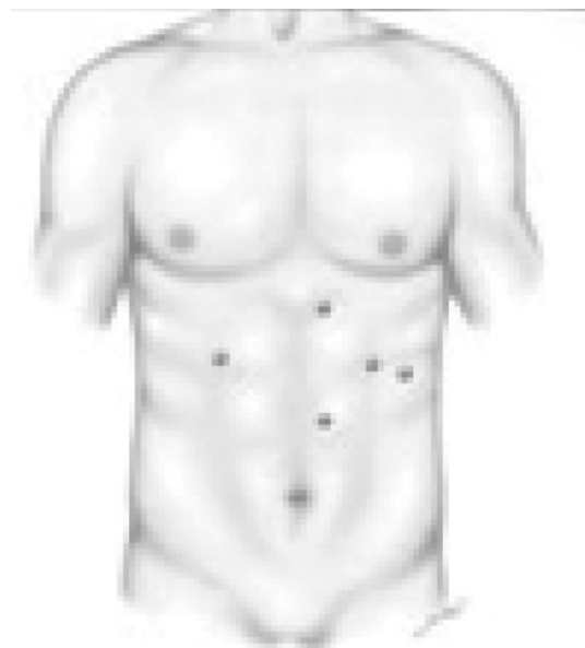
FIGURE 1 - Trocars position

The operation consisted on dissection of the stomach in the transition corpus/fundus with oblique section with linear stapler. Then, the proximal gastric pouch was repaired with laminar drain, and passed to the lower abdomen, through an opening made in the mesocolon. The gastric stump was secured with sutures in the mesocolon. After identification of the ileocecal valve, was measured 80 cm proximal in the ileum marked with suture; another measurement with 170 cm in proximal jejunum was made, the jejunum was cut along its mesentery using linear stapler and, then, an anastomosis was made suturing proximal jejunum to the ileum site previously marked. The operation continued with the gastroenteric anastomosis, latero-lateral with 45 linear stapler. Finally was proceeded mesenteric closure (Figures 1 and 2).