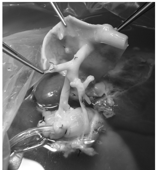
FIGURE 2 – Illustration of an accessory right hepatic artery (ARHA) reconstruction anastomosed with the splenic artery (SA), using a superior mesenteric artery Carrel-patch

This technique was successfully applied in four consecutive cases of R/A-RHA in liver transplantation among a total of 120 deceased donor transplants during the year 2010 by the same surgical team at the Department of Liver Transplantation, Hospital das Clínicas, Faculty of Medicine, University of São Paulo, SP, Brazil. Figure 2 shows a typical back-table R/A-RHA reconstruction. Was observed that the procedures, performed as described, facilitated subsequent arterial anastomosis on the recipient patients. After back-table reconstruction was found that the technique allowed a good flow of the preservation solution.