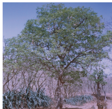
Figure 1. Aspect of Abelmoschus manihot (L.) Medik., Malvaceae and Wrightia tinctoria R. Br., Apocynaceae