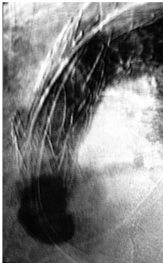
Fig. 2 – Rigid guidewire positioned inside the left ventricle