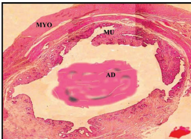
FIGURE 2 – Photomicrography of uterine tube transversal cut in an animal of 180 observation days. AD (adhesive), MU (mucosa) and MYO (myosalpinx). (HE-20X)