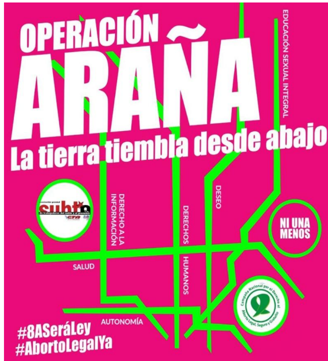
Figure 1 – Information Poster for Operación Araña.

The emphasis placed on the need for a community web was made explicit in metro line C, as activists on that line situated the demand for autonomy over one’s body within a collectivity of community bonds and support networks and as the continuation of a struggle fought by other women in other times and other territories. Part of the official statement read out loud by organizers on the line C trains declared: “We do not demand a separate individual’s autonomy, but an autonomy that unfolds as common desire” (Lobo Suelto!, 2018). As to the other lines, while metro line A feminists focused on abortion as a human right to decide over one’s own body, those on metro line H approached it as a public health concern. Questioning motherhood as a social mandate, the intervention performed on metro line B advocated for motherhood as a choice and a desire, aided by the hashtags “#LaMaternidadSeráDeseada-ONoSerá” (Motherhood will be desired or won’t be) and “#NosMueveElDeseo” (Desire Moves Us). On metro line E, a demand was articulated in favor of access to the information necessary to decide over one’s body in the face of widespread oppressive misinformation, and activists on line D called for the application of the Law for Educación Sexual Integral (ESI: Comprehensive Sex Education) in all schools. True to its spirit of taking over and redefining categories,