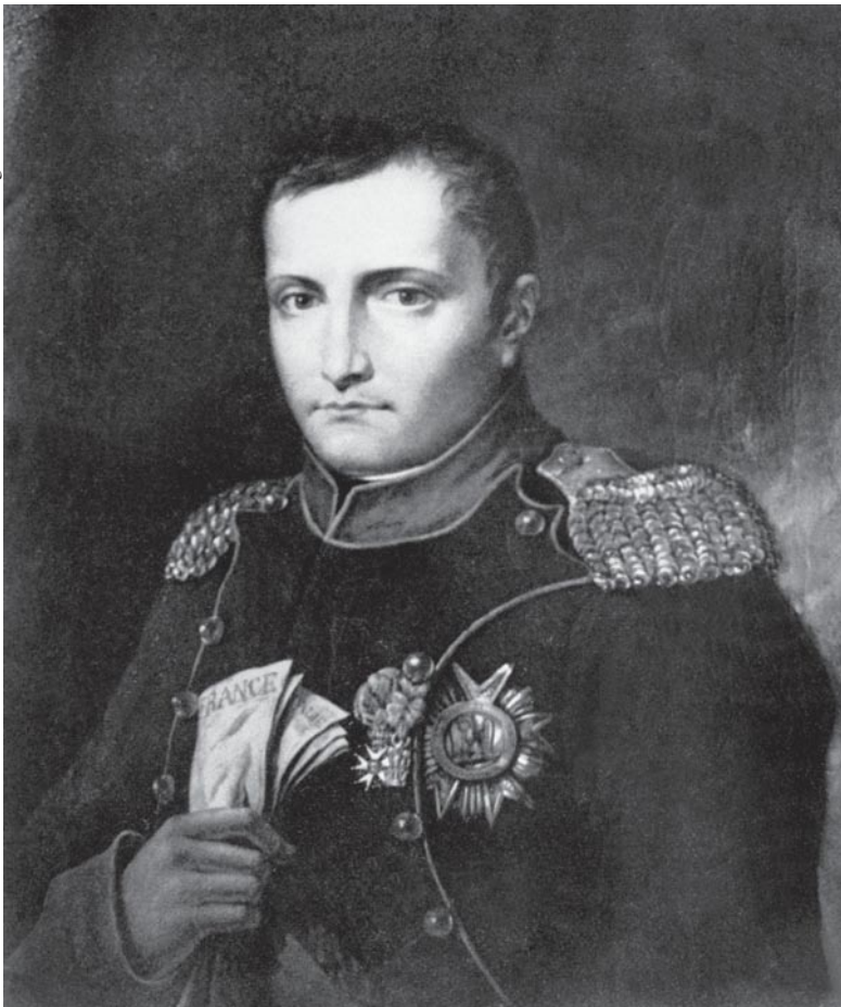
Napoleon Bonaparte (1769 – 1821)