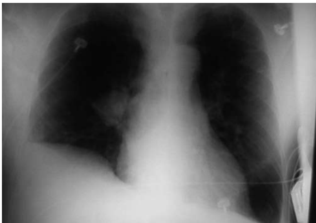
Figure 2 – Chest x-ray disclosing pulmonary hyperinsufflation, elevation of the right phrenic dome previous lobectomy due to benign pulmonary nodule and calcified hilar mass also to the right.

At pre-operative evaluation he was bedridden, with