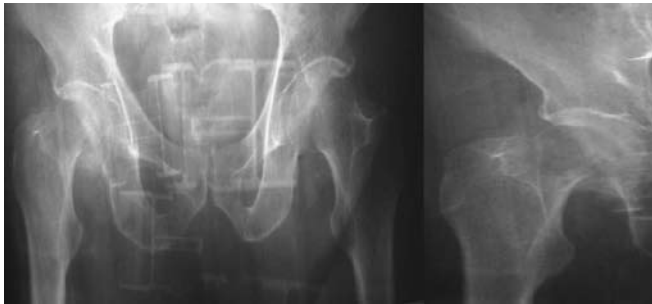
Figure 1 – Non-pathological fracture of the right femoral neck .

A male, 81 years old, 75 kg patient was admitted after a fall from his own height, presenting with pain, external rotation deformity and shortening of the lower right limb and was diagnosed as displaced femoral neck fracture Garden IV (Figure 1) with indication for partial hip arthroplasty. Bearer of severe COPD, presenting respiratory function test (RFT) with a forced expiratory volume in 1 second ( FEV_1 ) <20%, while using domestic oxygen therapy, corticoid therapy and presenting with dyspnea at minimal efforts.